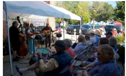
Early morning audience at Circle of Friends.