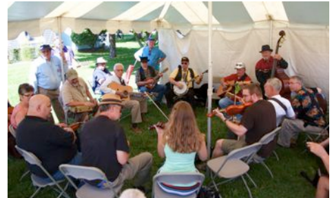
One of jam sites at Thumbfest 2016