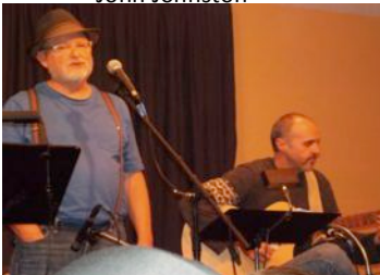
Wells & Witz