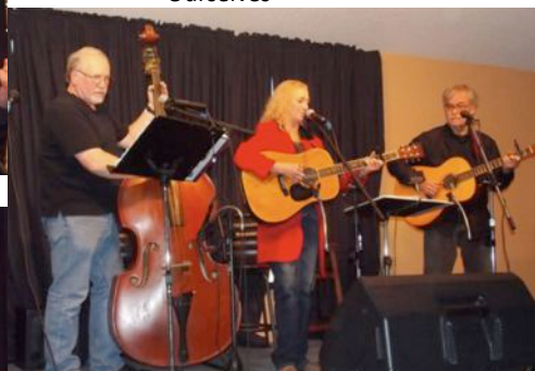
Circle of Friends