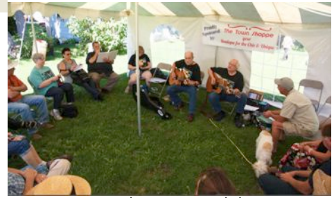
Mustards Retreat workshop