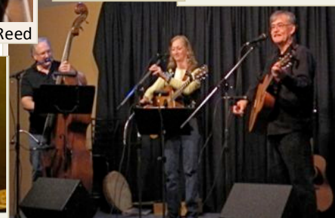
Circle of Friends