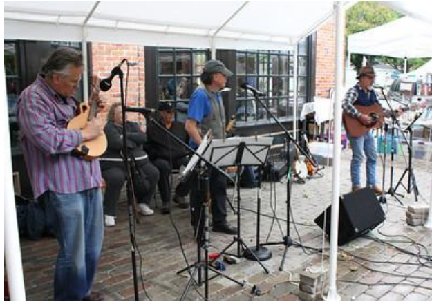
Ourselves at Smackwater Block Stage