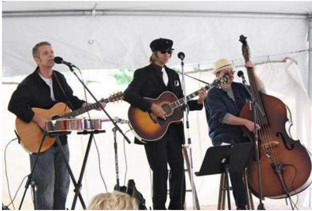
Gather Round at the Paint Creek Folklore Society Stage