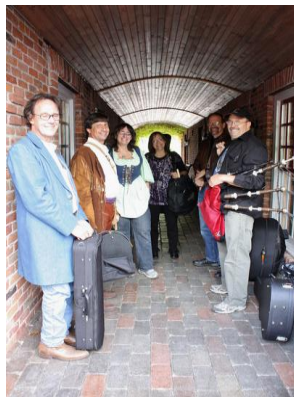
LeCompagnie out of the wind