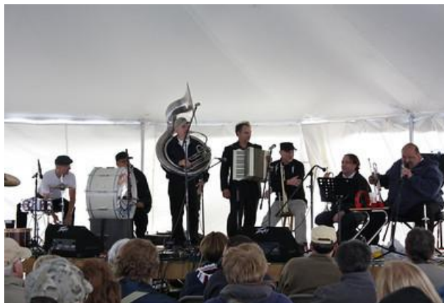
Ourselves at Virginia McNabb Stage