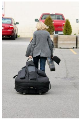
On my way