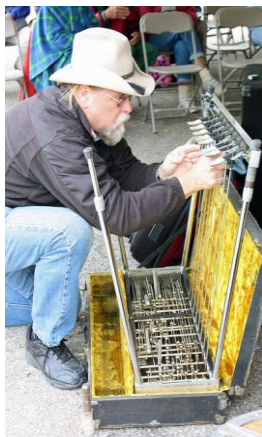
Petal Steel seen new way