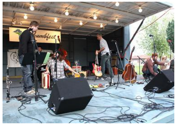
Setting up Red Sea Pedestrians at First Michigan Bank Stage