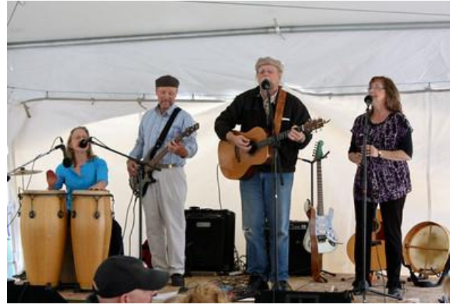
Duality at the Irish Rose Stage