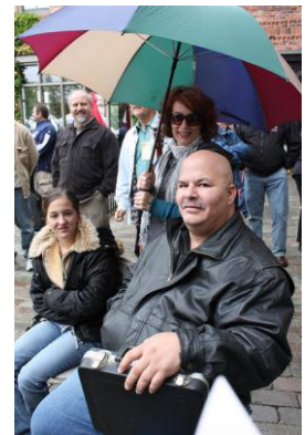
Rain did not stop them