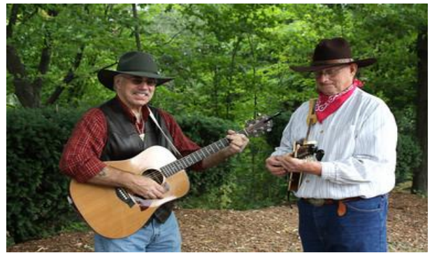
Campfire Compadres just practicing a bit