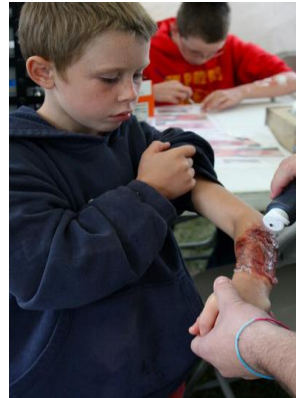
Kid's make-up session