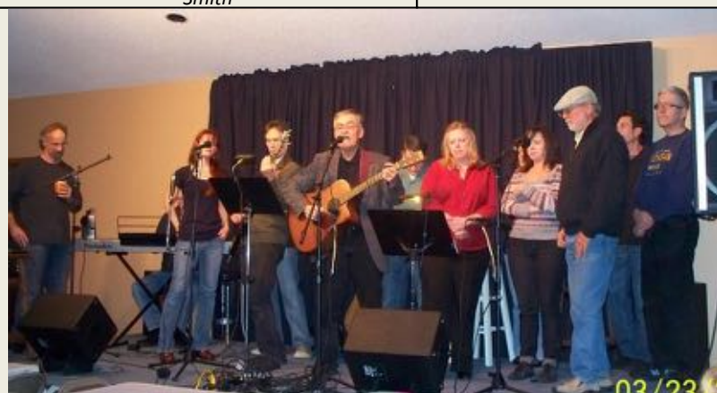
Hootenanny at the December Coffeeshouse Open Mic