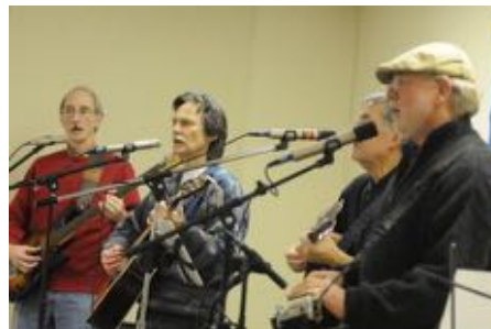
LOST CUZZINS...