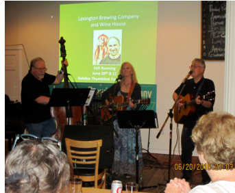
Circle of Friends