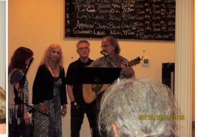
Still Running, Circle of Friends