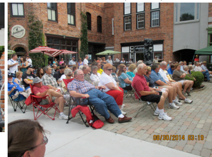
Come join the crowd at Thumbfest!