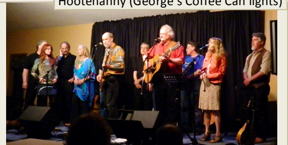
All the musicians at the Hootenanny