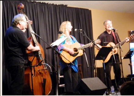
Circle of Friends