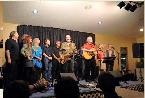
Hootenanny (George's Coffee Can lights)