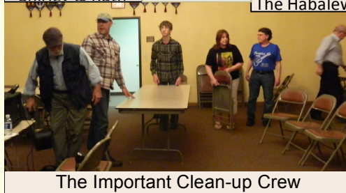
The Important Clean-up Crew

The Blue Water Folk Society wants to Thank You for YOUR Support !!