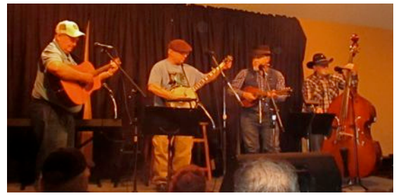
Black River Bluegrass Boys