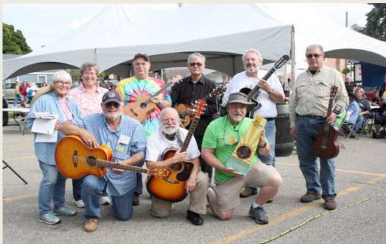
Some of G4K Donors and the Presenters at G4K 2017

Thanks for the support of our Grantors: DTE, Community Foundation of St. Clair County, Sanilac County Community Foundation and Sanilac Consortium for the Arts! We could not do it without you!