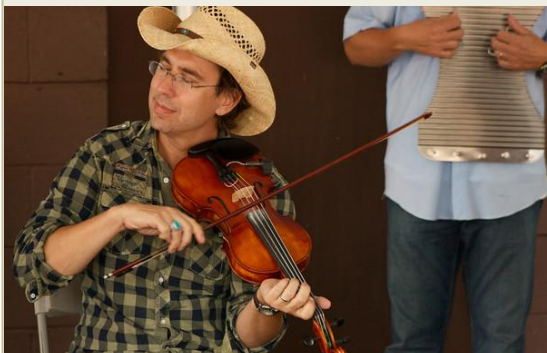
Sweet music & a washboard?