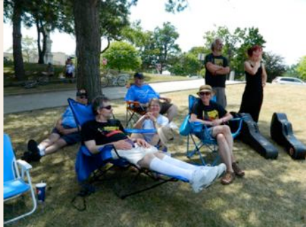
July 14 audience in the shade