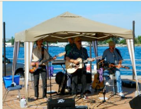
The Lost Cuzzins trying to find shade July 14