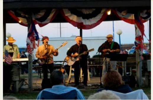
Pt. Sanilac July 7 th Lost Cuzzins