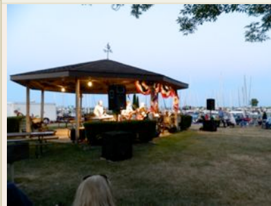
Pt.Sanilac Harbor Site