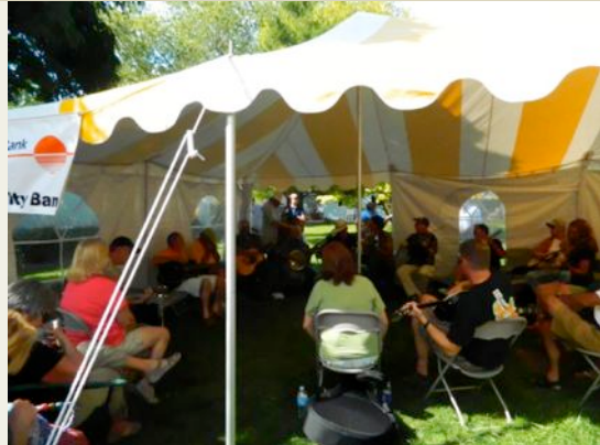
Country Jam at Thumbfest 2012 with all types of musicians playing ..very popular jam