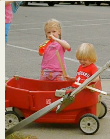
Future Musicians with plastic horn & paint stick drumsticks