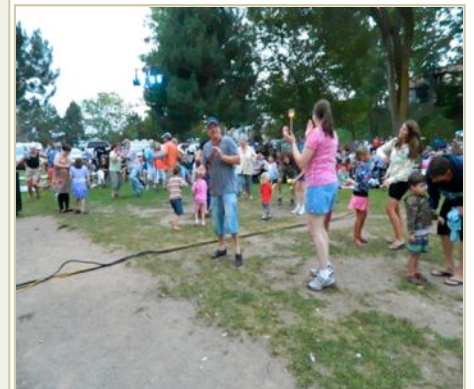
Audience dancing away for Dragon Wagon and then the Yellow Room Gang