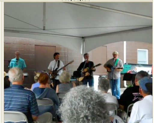
Lost Cuzzins at the Irish Rose Stage ...