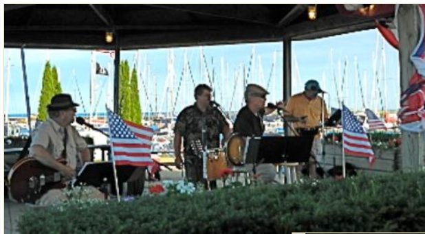
Pt. Sanilac July 7...Butterhair