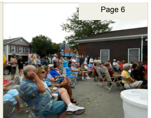
Very crowded Irish Rose Stage...thank goodness it did not drizzle...there would have been no