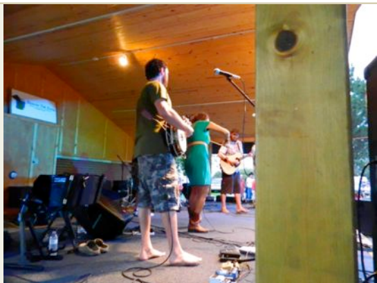
Dragon Wagon at the Lexington DDA Stage at the Harbor They really got the crowd dancing