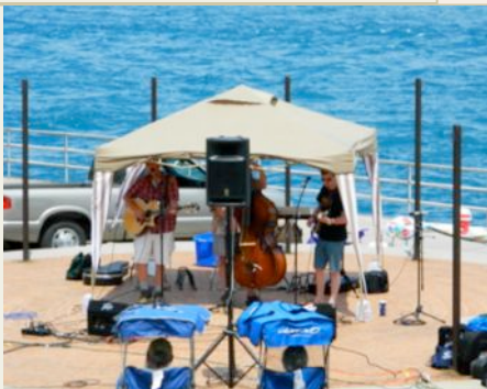
July 14 with Hackwells Pt. Huron