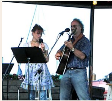
Pt. Sanilac July 7 .Still Running