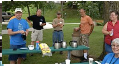
Tear-down crew Sunday after Thumbfest