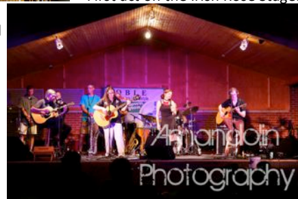
Last act... The Luddites at the end of the night...