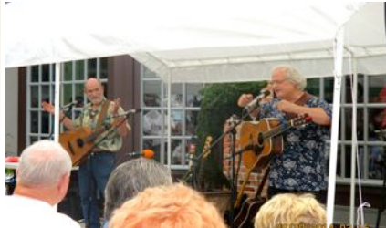
Mustard's Retreat...one of the favorites of the Thumbfest crowd